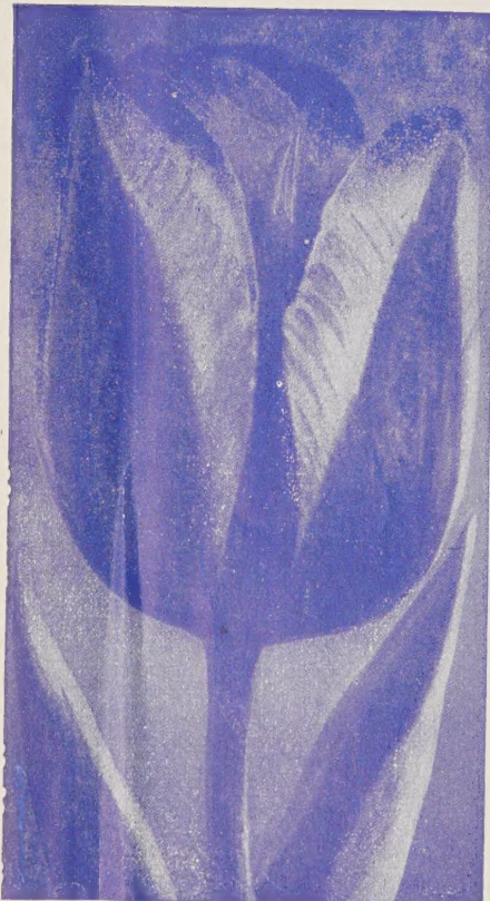
KEIZERSKROON Single Early Tulip